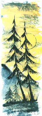
Gelobt sei der Herr täglich.

Yah heaps upon us ... what looks like tons of trouble, but turns out to be ... our salvation!